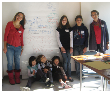
Village children with Fellows