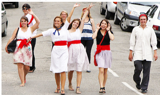
JMU students at the St. Noé Festival in 2010

VCCA welcomes the students in James Madison University's Study Abroad Program back to Auvillar for a second year. These students engage in intensive painting and rigorous drawing in the landscape and in the studios. There are also excursions to Musée Ingres in Montauban and the Augustins in Toulouse, and time for engagement with village life. Last year, the students especially enjoyed the St. Noé Festival.